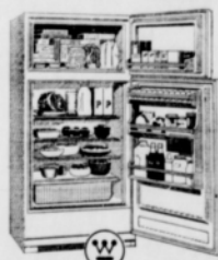
WESTINGHOUSE REFRIGERATOR 14 CU. FT.