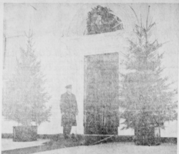
Entrance to the White House at Washington as it appears each year during the Christmas season.

Jackson's party for the orphans was inspired by his own sad boyhood. At his party Santa Claus came to the White House as usual, leaving many gifts for the homeless