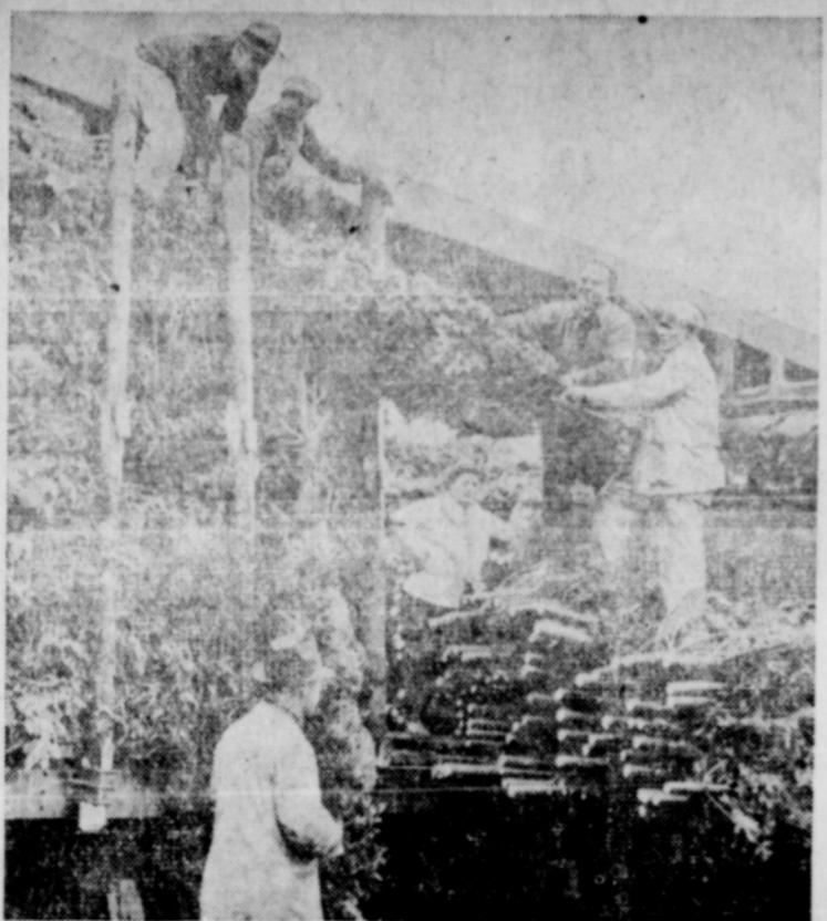
From verdant forests throughout northern America, trees to grace the nation's Christmas morning are shipped each year. This picture was taken in Maine, where 1,500,000 trees are being felled for the holidays, to be loaded for shipment to all parts of the United States.