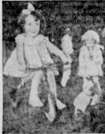
"Whee-e-e! Some tricycle Santa left me. There's so much to play with that I hardly know where to start. Wouldn't it be nice if Christmas came every day? But maybe that would be too much work for Santa Claus, and, after all, maybe I'd get kind of tired, too."