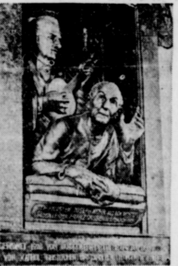
This monument at Oberndorf, Austria, honors Joseph Mohr, who wrote the words to "Holy Night," and Franz Gruber, who wrote the music for one of the world's most beloved Christmas hymns.