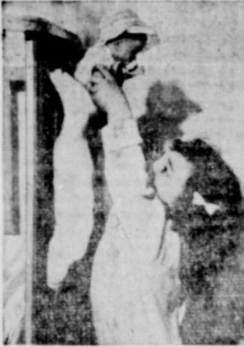
"What's this? Another doll! Kind of hard to get it out. Wonder what else is in this big stocking... maybe it's the candy I ordered from Santa Claus."