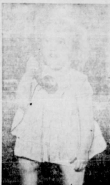
"Hello, Santa! Sorry I'm so late but Christmas is just around the corner and I'd like to place my order. Bring me a doll, a teddy bear, a tricycle, a toy piano, a bag of candy, a new dress and a... What's that, Santa? Have I been a good girl? Of course I have! Er... that is, I hope I have."