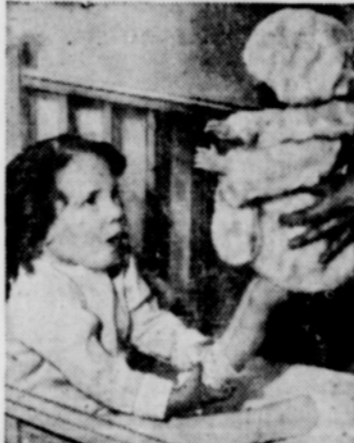
"Look at that doll! Santa WAS here last night, wasn't he, mummy? Guess I must have been an awfully good girl to deserve a doll like this! Brown eyes, real hair, a pretty dress... 'n everything!"