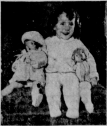
"Here it is bedtime already. I've had a busy day but I'm really not tired. Better go to bed, though, 'cause mummy says I should... and I really ought to be a good girl after this wonderful Christmas. Thanks a lot, Santa Claus!"