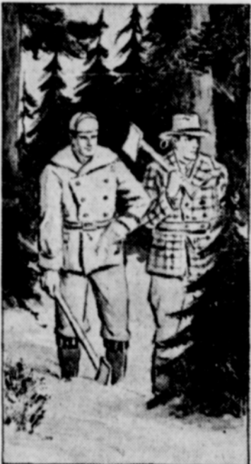
"I never saw a more beautiful tree," he said. "It seems to glow."

The tall trees began to tremble. "The woodcutters are out. But this is a funny time of year," one mur-