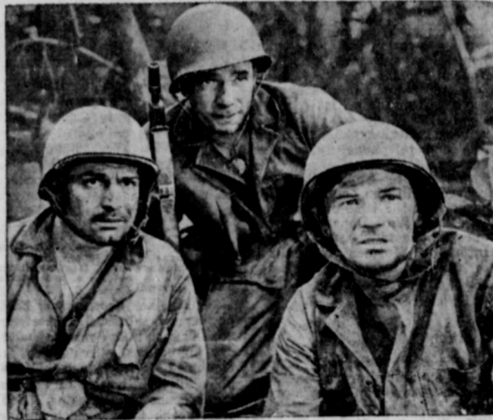
John Garfield, as Marine hero Al Schmid, and Dane Clark, as his fighting buddy Lee Diamond, as they appear in a dramatic mo- ment in Warners' moving drama, "Pride of the Marines" at the Plaza Theatre, Sunday and Mon- day. Also starred in the film is Eleanor Parker.