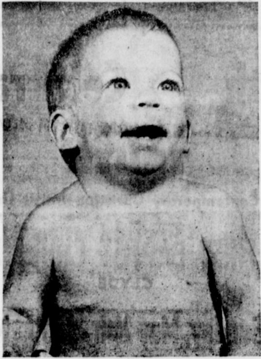
"You mean my balance agrees with the bank's . . . for once?"

Sure . . . and that means you're accurate to the penny. We use the most advanced methods to insure accuracy in our records. It's just part of our COMPLETE banking service to make you happy you bank with us. Come in and get acquainted with all our services . . . Checking Accounts, Savings Accounts, Safe-Deposit Boxes, Home Loans, Crop and Livestock Loans, Auto Loans, Estate Administration, and there are still more services . . . ask us about all of them.