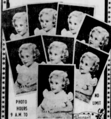
PHOTO HOURS 9 A.M. TO CLOSING

KING SIZE WALLEY CREATIVE COLOR PORTRAITS FOR ONLY