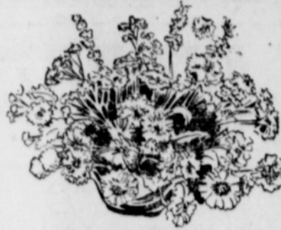
Our Sympathy Humoly Expressed