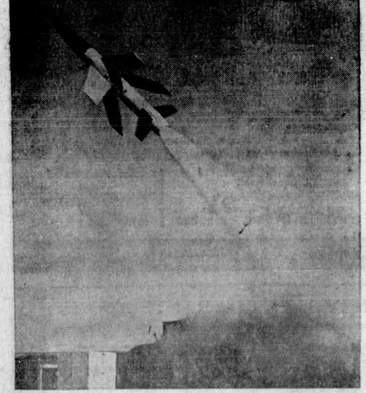
FIELD ARTILLERY MISSILE—The L-Crosse is another new Army guided missile developed for close tactical support of ground troops. An all-weather weapon capable of carrying highly-effective area type warheads, it will replace and supplement conventional artillery and is air-transportable.

The County tax office was still doing a pretty fair business on license plates Wednesday morning April 1 but the total sales so far is quite a bit under the number of tags issued at the same time last year. Up thru Wednesday morning, a total of 1,650 sets of tags had been issued and at the same time last year approximately 2,000 sets had been issued. This gives us a decrease of 350 which indicates a loss by people moving or out-of-county car owners registering in their own county this year.