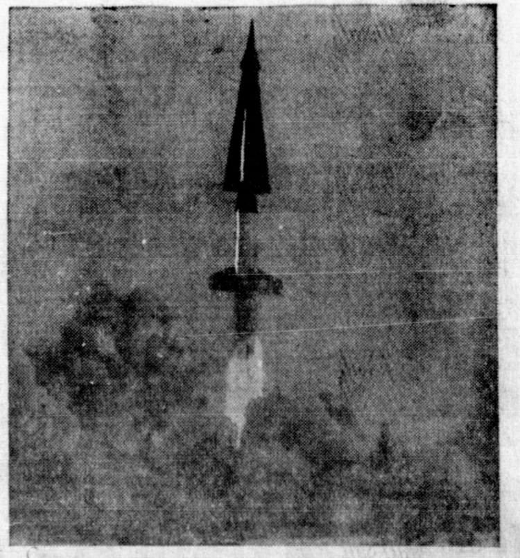
SECOND-GENERATION AIR DEFENDER—The Army's Nike Hercules guided missile, successor to America's first operational air defense missile, Nike Ajax, is on site guarding U. S. cities and defense installations in this country and overseas. It is air-transportable and more effective than the Ajax.