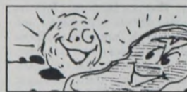
A slice of kiwi fruit rubbed on tough meat tenderizes it.