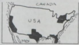
The five most populated states in the U.S. are California, New York, Texas, Florida and Pennsylvania.

During the week, students wore red ribbons and were given stickers to stress the theme "Drug-Free Begins With Me." It is hoped that all students realized that You Can Have a Lot of Fun and Be Drug Free!!!