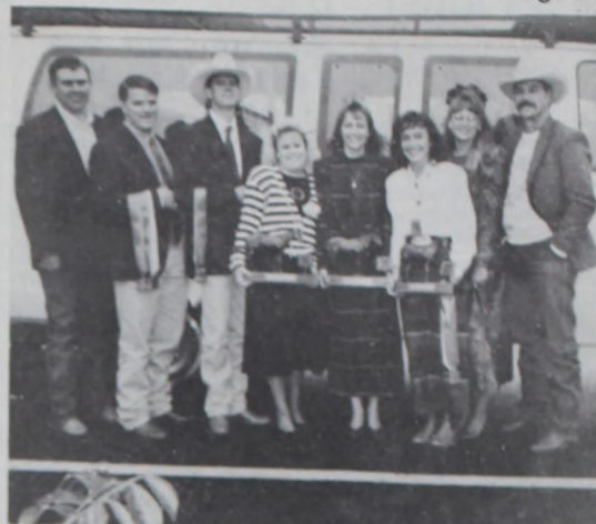
WTAMU Horse Judging Team