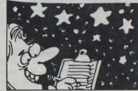
About 6,000 stars shine bright enough to be seen without a telescope.

Just imagine, by hosting a cultural exchange student, you are helping to build a bridge of peace between world nations increasing harmony among all people. For complete details on hosting an exchange student, please contact the Youth Exchange Service at (800)320-HOST.