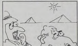
The Great Pyramids of Egypt are the only surviving Wonder of the Ancient World.