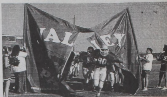
Valley Junior High bustin' through in 2002!

Lorenzo de Zavala, first Vice President of the Republic of Texas, born in Yucatan, Mexico, died November 15, 1836, in Texas.