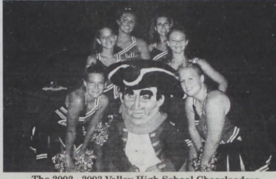
The 2002 - 2003 Valley High School Cheerleaders.