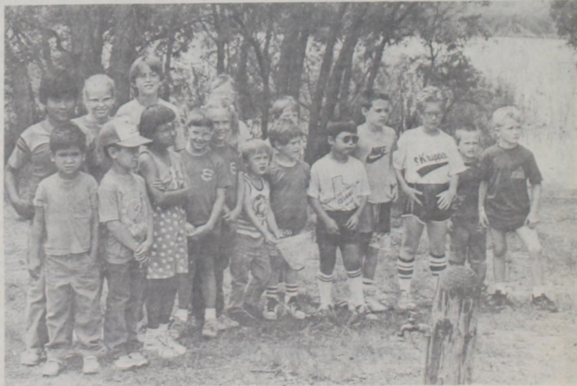
All the winners at the Kid's Fishing Rodeo Saturday at Caprock Canyons State Park.