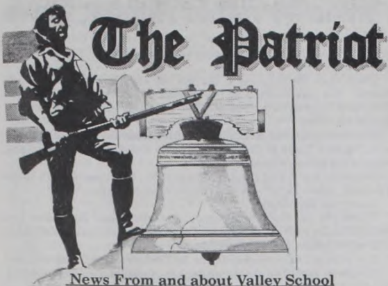
News From and about Valley School