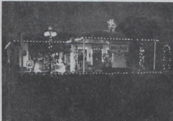
Karol's Kountry Korner won first place in the business portion of the Christmas lighting contest.

There are many things that we, as women, can contribute to our community by working together and pooling our talents and energy.