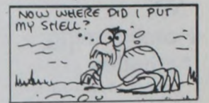
A hermit crab lives in the shell of a sea snail.

Great grandparents are Burland Vida Mae Pierce and Lewis and Mozelle Eudy all of Turkey.