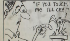
Leaves of the sensitive plant react quickly-folding up tightly exposed to strong fumes.