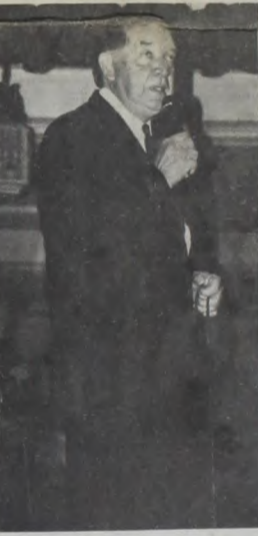
Ray Price in Concert

TNRCC has set the drinking water standard at 10 parts per million (ppm) for nitrate to protect against the risk of these adverse effects. It has also set a drinking water standard for nitrite for 1 ppm. To allow for the fact that the toxicity of nitrate and nitrite are additive, TNRCC has also established a standard for the sum of nitrate and nitrite at 10 ppm. Drinking water that meets the TNRCC standard is associated with little to none of this risk and is considered safe with respect to nitrate.