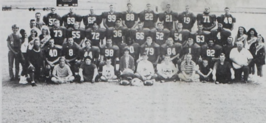
1998-99 VALLEY PATRIOTS