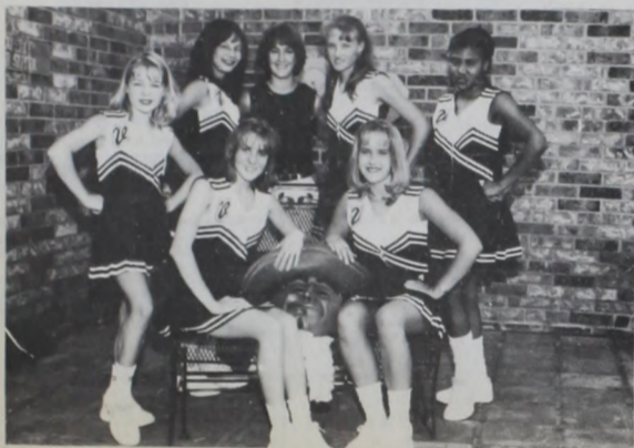
1998-99 VARSITY CHEERLEADERS