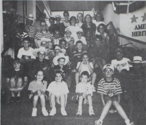
BRISCOE COUNTY 4-H HORSE CLUB WHO ON AUGUST 6, 1998 TOURED AQHA MUSEUM IN AMARILLO.