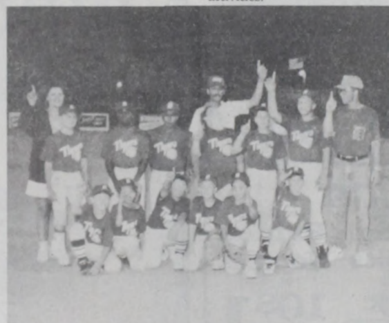
Undeclared All Star Team - Valley School

The Briscoe County Commissioner's Court has adopted a restricted smoking policy for the County Courthouse. Under the new policy, each County Official will set smoking rules for their individual offices. Smoking will be prohibited in all other areas of the Courthouse.