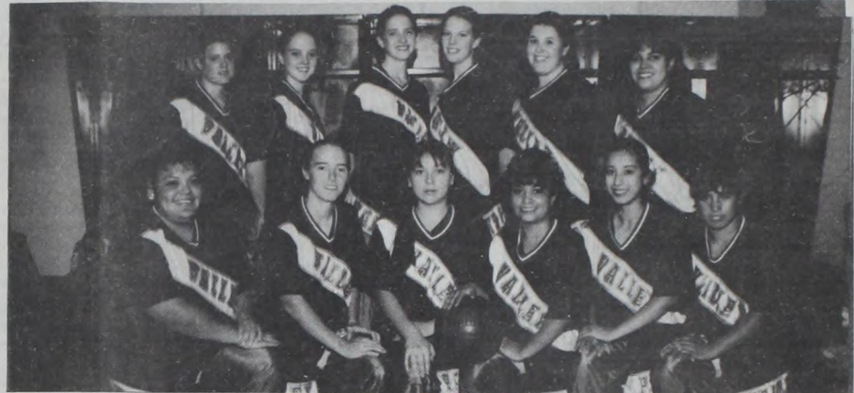
LADY PATRIOTS BASKETBALL TEAM