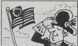
The American flag first received a foreign salute in 1778 in Quiberon Bay, France.