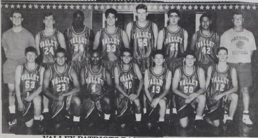
VALLEY PATRIOTS BASKETBALL TEAM