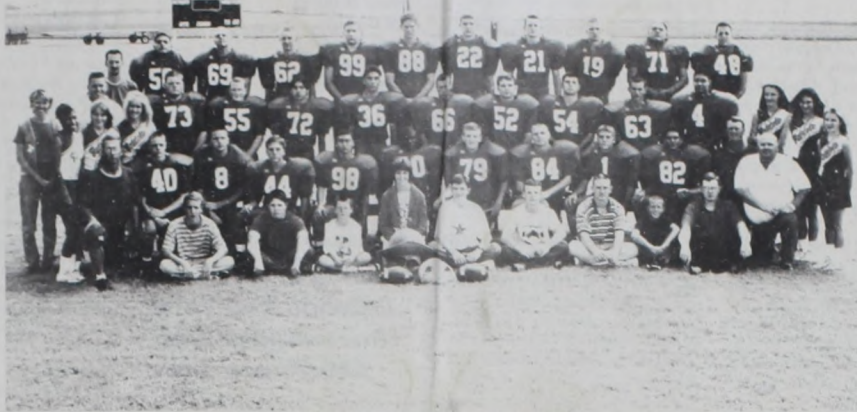
1998-99 VALLEY PATRIOTS

(S) Scrimmage (H) Homecoming (D) District