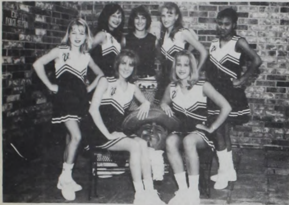
1998-99 VARSITY CHEERLEADERS