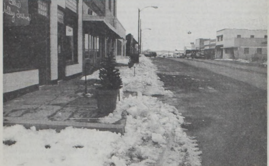
MAIN STREET IN QUITAQUE FOLLOWING THE SNOW STORM DURING THE CHRISTMAS, NEW YEAR HOLIDAYS AFTER THE TEXAS DEPARTMENT OF TRANSPORTATION BLADED MAIN STREET.