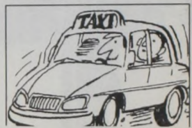
The word taxi is a shortened form of taximeter cab.

Five trees were displayed by Just Because that had been decorated by different organizations in the Quitaque area. A can of food was the price per vote on each tree.