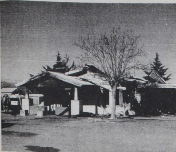
PICTURED ABOVE IS THE KOZAR HOME FOLLOWING AN EARLY MORNING BLAZE ON DECEMBER 21, 2000.

The future is not some far-off thing. It comes quietly one day at a time. The past cannot be changed, the future is still in your power. As we enter a New Year may you have peace, understanding, love and eternal hope to face whatever may lie ahead.