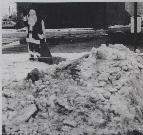
SANTA SEEMS TO BE SCOLDING THE SNOW FOR HARRASSING THE CITIZENS OF QUITAQUE DURING THE HOLIDAYS. THE PICTURE IS IN FRONT OF THE QUITAQUE POST OFFICE.