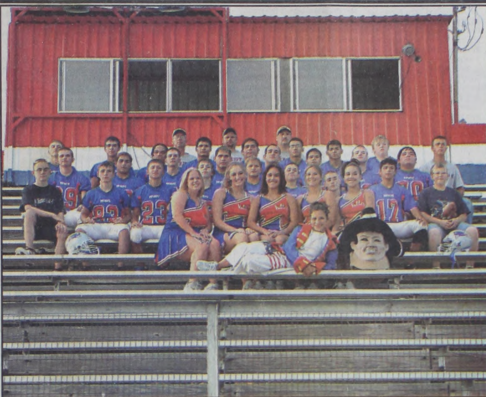
The Valley Patriots are ready to start off another successful year as they scrimmage Lazbuddie tonight at 6 p.m. at the Valley field.