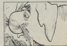
An elephant may consume 500 pounds of hay and 60 gallons of water in a single day.