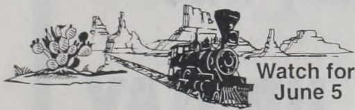
Watch for June 5

Friends of Caprock Public Library would like to encourage everyone to stop by the library to see the wide selection of material and services available. The Caprock area is fortunate to have the availability of a fax machine, a VCR and a 486 computer with CD-ROM. The next project of the Friends is to purchase a copier to be placed in the library for public use. Contributions for this project can be made at the library.