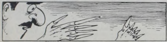
Fingernails grow faster than toenails. The average growth rate of nails is 1 1/2 inches a year.

Another provision increases the personal needs allowance for the SSI recipient in a medical institution where Medicaid pays half or more of the care from $25 to $30 a month. It is effective July 1, 1988.