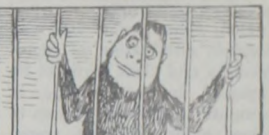
The world's largest zoo is the 650 acre Whipsnade Zoo near London, England.

Valley Jr. High Patriots vs Bovina Mustangs Thursday 5 p.m. there