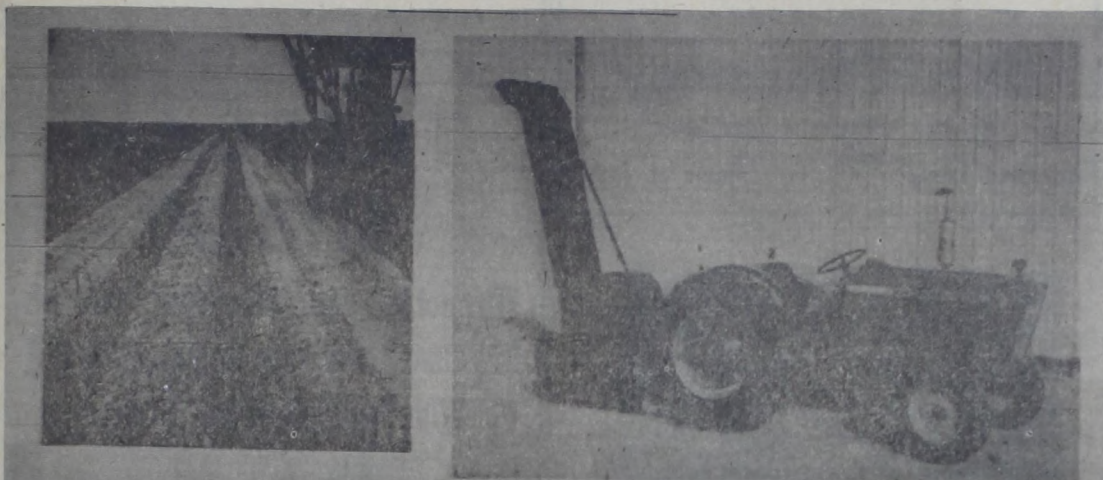
2-OR-4 ROW UNITS AVAILABLE