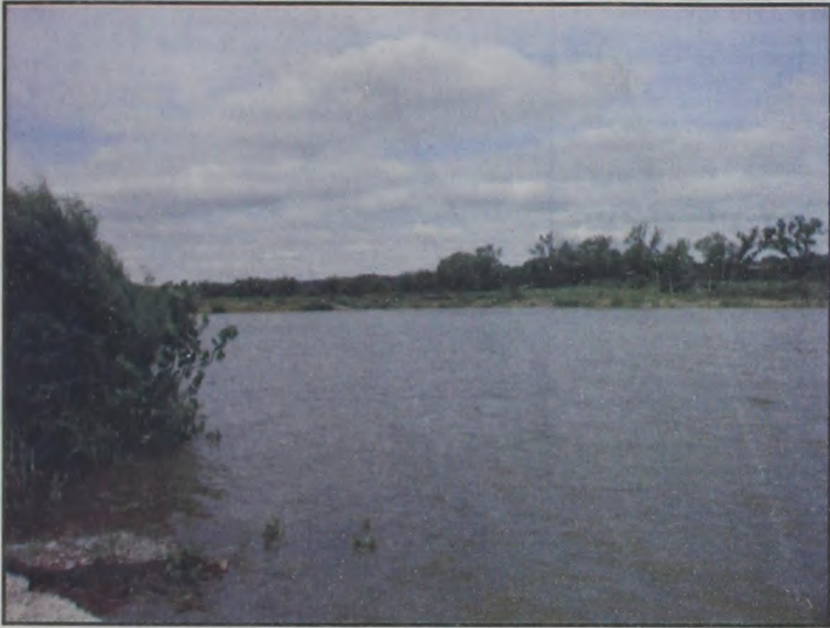
Lake Theo at Caprock Canyons State Park is up approximately six feet with recent rains, making it ready for lots of summer fun!