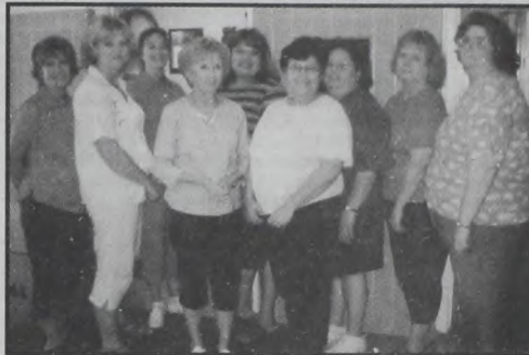
Valley teachers enjoy their summer classes, it gives them a chance to work one on one with students in a more relaxed setting than the regular school year.