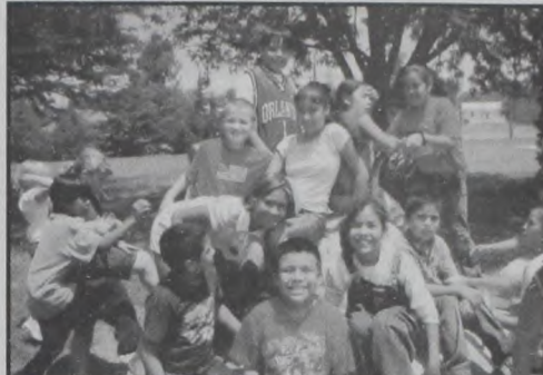
These summer students at Valley School recently attended the Amarillo Opera as part of their summer studies.

A play was presented by the students at the end of the program. The children received a standing ovation.