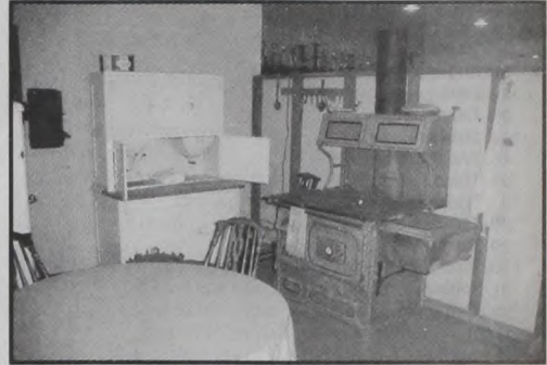
This display is one of many depicting early life in Turkey and the surrounding communities. It can be seen Friday & Saturday from 10 a.m. - 4 p.m. at the Turkey Roost Museum.