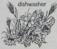
Give Mom a Frigidaire dishwasher on her day

Smart styling is only how good Frigidaire looks — the real worth of Frigidaire is how good it cleans dishes, pots, pans, glasses and silverware.