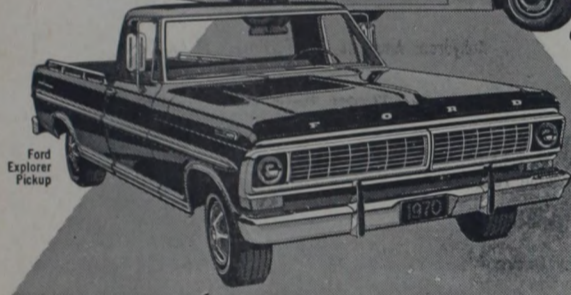
Ford Explorer Pickup