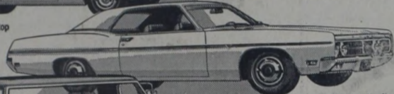
Galaxie 500 2-Door Hardtop