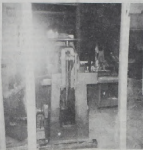
Workers from A-1 Southwest Printers Supply in Dallas work on old printing equipment here Tuesday, getting it ready to move out of the former Tribune office. The equipment will be sold to print shops in Old Mexico.