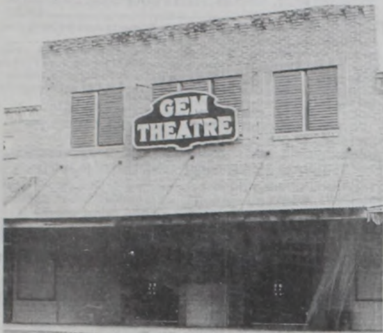
The Gem Theatre in Turkey will be the scene of New Musical Gray's Stock Company Show April 29, 2000.