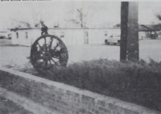
Caprock County Christmas comes to Merrell Food.