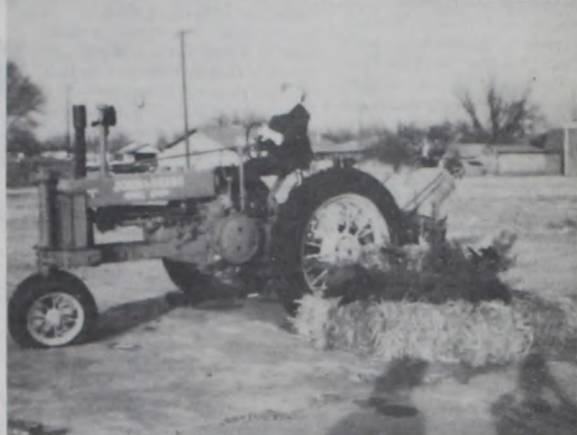
Santa rides Ye Old John Deere