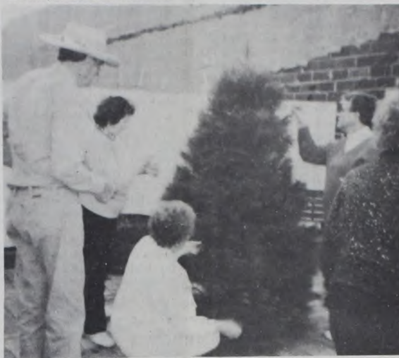
Quitaque folks decorating the mini-park Christmas tree in preparation for Caprock Country Christmas Saturday.