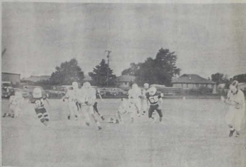
Valley vs. Higgins