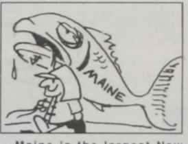
Maine is the largest New England state.

Immunization methods have been developed to help avoid discomfort. Polio vaccine is given in drops that babies swallow. Other vaccines have been combined, making fewer shots necessary. For instance, measles, mumps and rubella vaccines are usually given in one injection. And Haemophilus influenzae type b vaccine has been combined with diphtheria, tetanus and pertussis vaccines. If you think your baby's reaction to his shots was unusual, tell your doctor or nurse before the next series of immunizations.