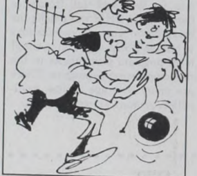
Charles Goodyear discovered how to vulcanize rubber in 1839.

The family suggest memorials be to St. Anthony's Hospice and Life Enrichment Center in Amarillo or to a favorite charity.