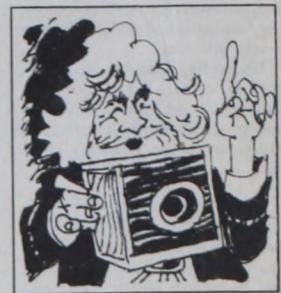
The first photograph made in the United States was taken by Samuel F. B. Morse in 1839.