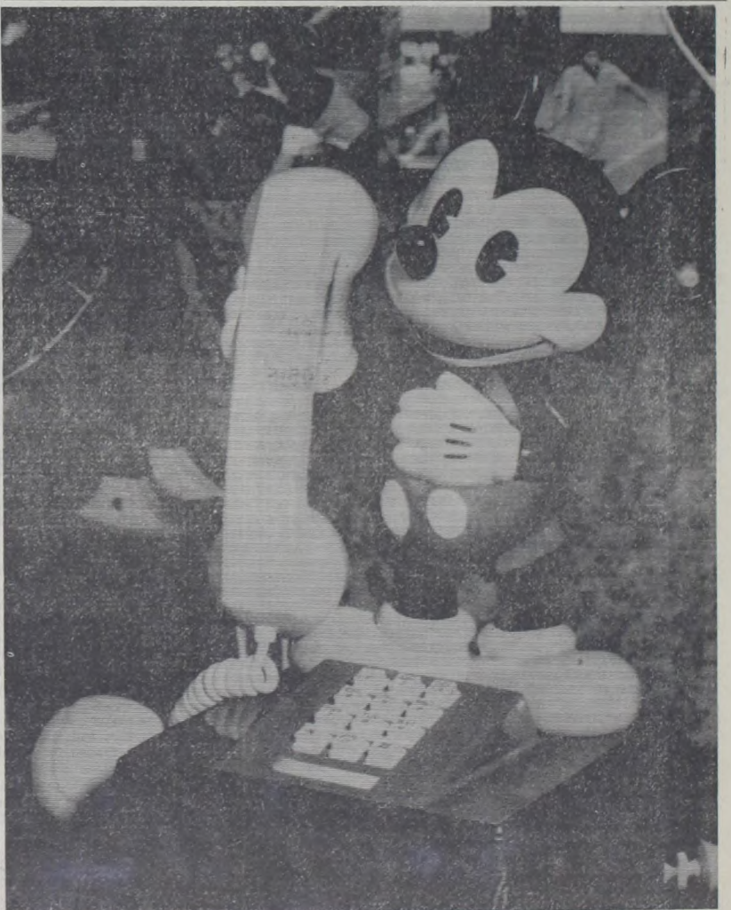
Mickey Mouse, who has been many things to many people, has assumed still another role: he is a telephone! Now available

local coordinator, and will be enlisting volunteers from the communities to assist with operation of the clinic.