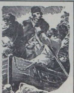
CROSSING THE DELAWARE