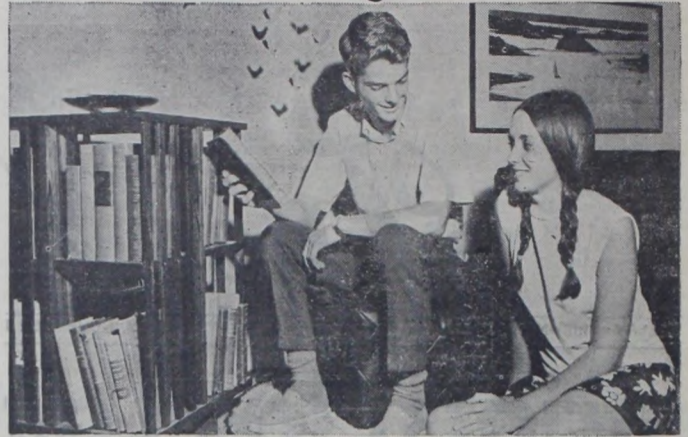
4-H'ers in the 4-H home environment program create comfortable and pleasing living spaces. These 4-H'ers built a bookshelf and a mobile to improve the total environment of their rumpus room.

SPECIAL - What's in a name? Plenty, think leaders working with 4-H members in the area of home furnishings, equipment and housing.