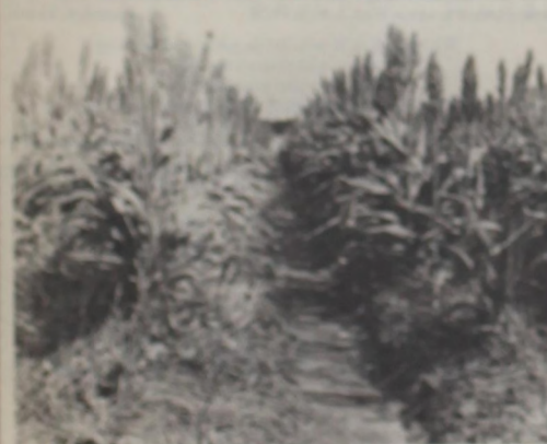
About 100 people attended the Ag Field Day to learn more about reduced tillage farming methods. About 150,000 acres in Belton County are farmed using some form of reduced tillage.