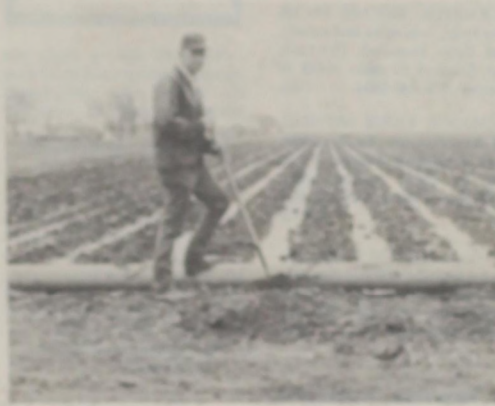
27,861 feet of irrigation pipelines were installed in 1983 to help farmers use water more efficiently.