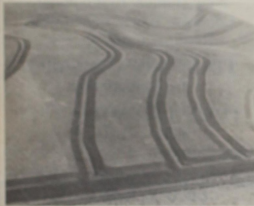
231,794 feet of terraces were installed in 1983 to help reduce water erosion on erodible in Belton County.