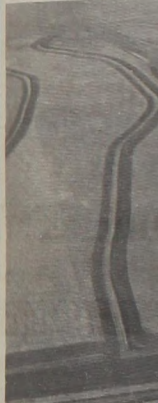
231,794 feet of terra help reduce water er County.

Membership and State Assoc tricts. Support Association, as we