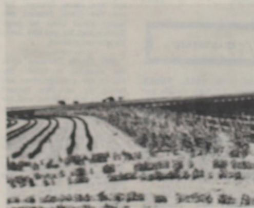
Strips of wheat, haygrass, or grass are planted as terraces to break up the wind and reduce wind damage to cotton fields.