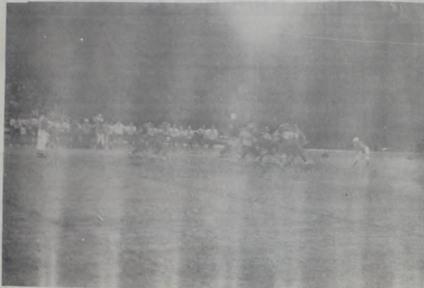
A hard fought Valley-McClean football game resulted in a McLean victory Friday night.