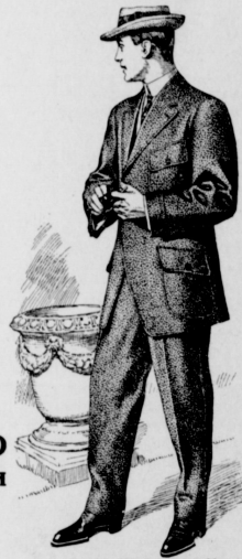
Copyright 1908 by Hart Schaffner & Marx

Prices $18.00 to $25.00 CHEAPER ONES IF YOU WISH