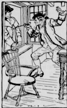
"We decided for this" rose. And now, deceitful, double faced!"

you cruel woman. Isn't it all yours, and aren't you sticking pins into it for sheer devilment this minute? God forgive me that I should say such a thing of an angel! Look at it now, Kitty. Is that the heart of a cucumber? If you had said a love apple itself—Och, indeed, it's the real cool cucumber I am, and it's toast and water that's running through my veins like fire! Laugh, madam; laugh; it's a grand joke entirely. Make a pincushion of the cucumber! See, now, is that small ale that bursts from the wounds? Up on my soul," he cried, arrived at the height of his temper, "I have a mind to show you the color of it!"