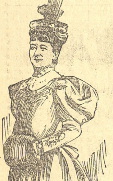
Empress of Germany.

satins that fitted the body-line and terminated at the edge of the ripple skirt. The sleeves were a little full at the shoulders, but shaped in to fit the arm.