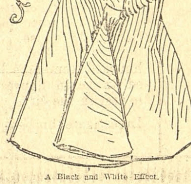
A Black and White Effect.