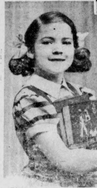
and with Party Curl.

bouncy waves. If your little girl has long hair, Miss Potter recom- mends a permanent only in the ends of the hair. Roll each curl one turn above the place where you want the wave to start. If her hair is short, curls should be rolled to the scalp to get the most out of a permanent. Party Curl, a home permanent made specially for children, gives you a choice of a tight or a loose wave. Although it requires no neutral- izer you can have a tight wave, by allowing the hair to dry thor- oughly on the curling rods, or you can unroll it after a speci- fied time while it is still damp and let it dry in a net or scarf, for a softer wave. Either way, you'll find a little curl makes hair easier to take care of. All lit- tle girls love it. (All rights re- served.)