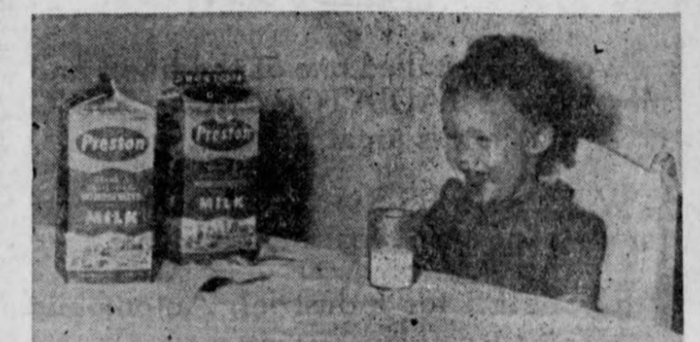
Children get a terrific bang out of Preston's Milk, Homogenized or Pasteurized. Contact our distributor or pick up a supply at your favorite grocery store. It's always Fresher by a Day!

PRESTON DAIRY PRODUCTS TOM COVINGTON, Wholesale Distributor IOWA PARK