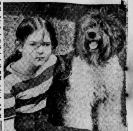
The Shaggy Vacation Team.

Home permanents can take much of the credit for this transformation, says Katherine Potter who heads the beauty and grooming depart- ment for Procter & Gamble. Hair that seems completely unman- ageable, becomes as doc- ile as can be, when it has a soft permanent. Even braids look prettier if the hair ends are curled. Then, on holidays or party days when dress- up hairdos are called for, the curl is there already to be brushed into soft