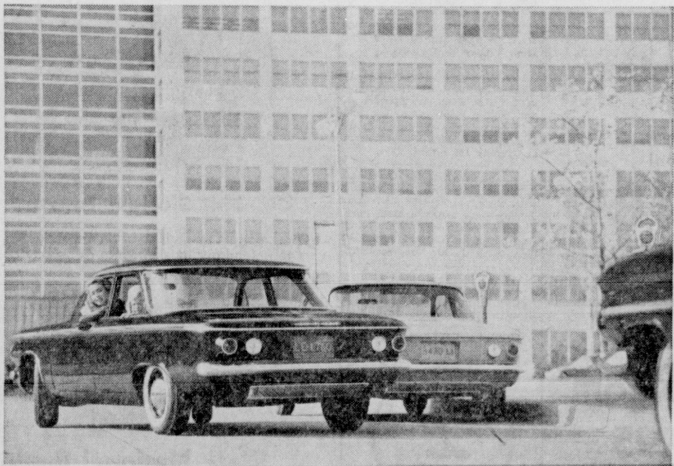
Corvair 700 4-Door Sedan

See your local authorized Chevrolet dealer for economical transportation