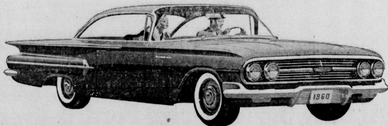
There's nothing like a new car—and no new car like a Chevrolet. This is the 1960 Chevrolet Bel Air Sport Coupe!