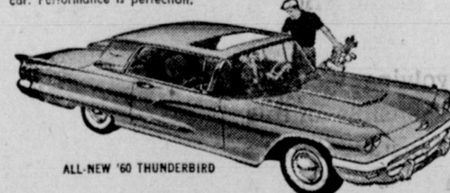
ALL-NEW '60 THUNDERBIRD

The fabulous Thunderbird, the world's most wanted car is finer than ever. Every detail says it's the ultimate luxury car. Performance is perfection.