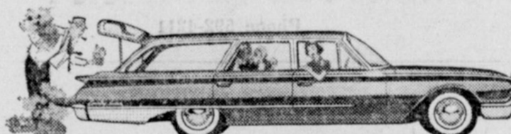
ALL-NEW 6-PASSENGER COUNTRY SEDAN

What a year to go Ford! Why not own the latest version of the world's most wanted wagon? Or perhaps you'd like the new, beautifully proportioned Galaxie below . . . an economy-minded Fairlane . . . or a big-value Fairlane 500. Maybe you'd like the brand-new Starliner at right or a sleek new Sunliner convertible.