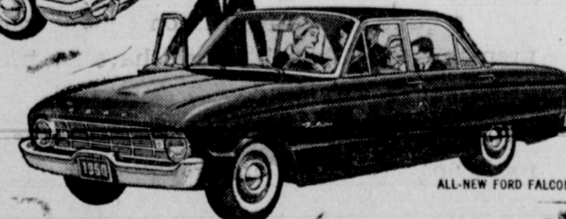
ALL-NEW FORD FALCON

Don't wait another second to see the car all America's been waiting for! The New-size Ford, the Falcon, lives up to your dreams of low price . . . ease of upkeep . . . and handling ease. And it's lovely to look at!