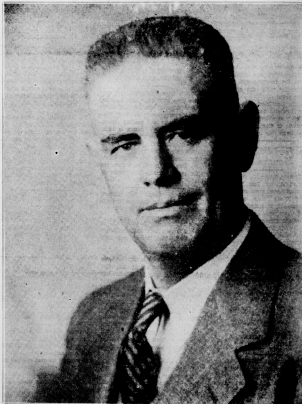
Candidate for the office of County Judge, Lynn County