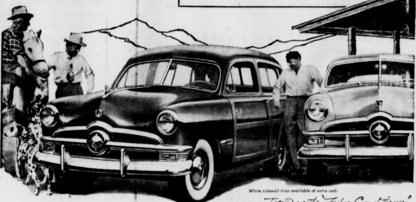
White sidewall tires available at extra cost.

Meet the "getaway" king of the low-price field: Ford's amazing new V-8. Meet its even lower-priced brother—Ford's new advanced "Six." They're partners in power... companions in quiet. For Ford engineering has "hushed" them both to a whisper. Remember only Ford in its field offers you a V-8... only Ford a pick of powerhouses.