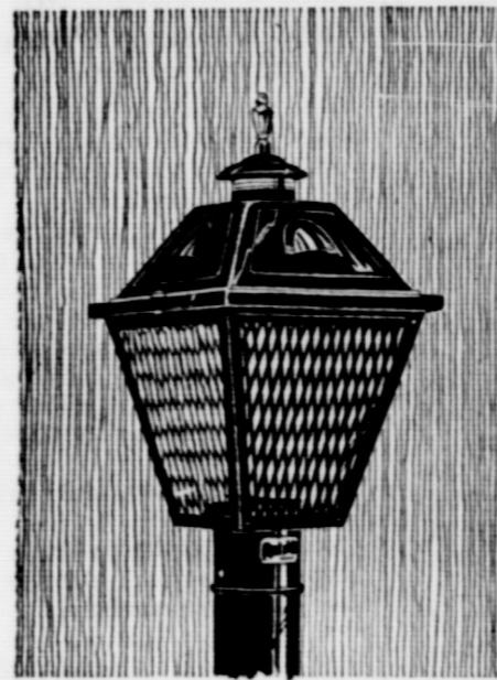
THE VILLAGER $59.50 INSTALLED*

Enjoy the beauty, safety and convenience of an on-at-dusk, off-at-dawn Ready-Lite in your yard at a low price that includes normal installation . . . and on easy terms. Contact Texas Electric Service Company for your Ready-Lite. Prices are as low as $59.50, and you can take up to 24 months to pay, with nothing down and payments added to your electric service bill. Select your electric Ready-Lite soon from attractive styles on display at our office, or call us for information.