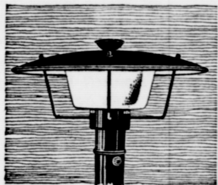
THE 20th CENTURY $69.50 INSTALLED*