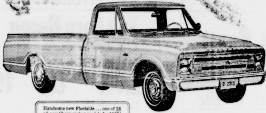
Handsome new Fleetalde... one of 26 all-new Chevy pickup models for 1967!