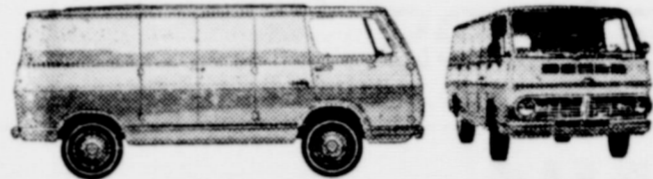
ALL-NEW CHEVY-VAN 108" WHEELBASE NEWLY STYLED CHEVY-VAN 90" WHEELBASE

New Chevy-Vans in two sizes for '67... new V8 power, too!