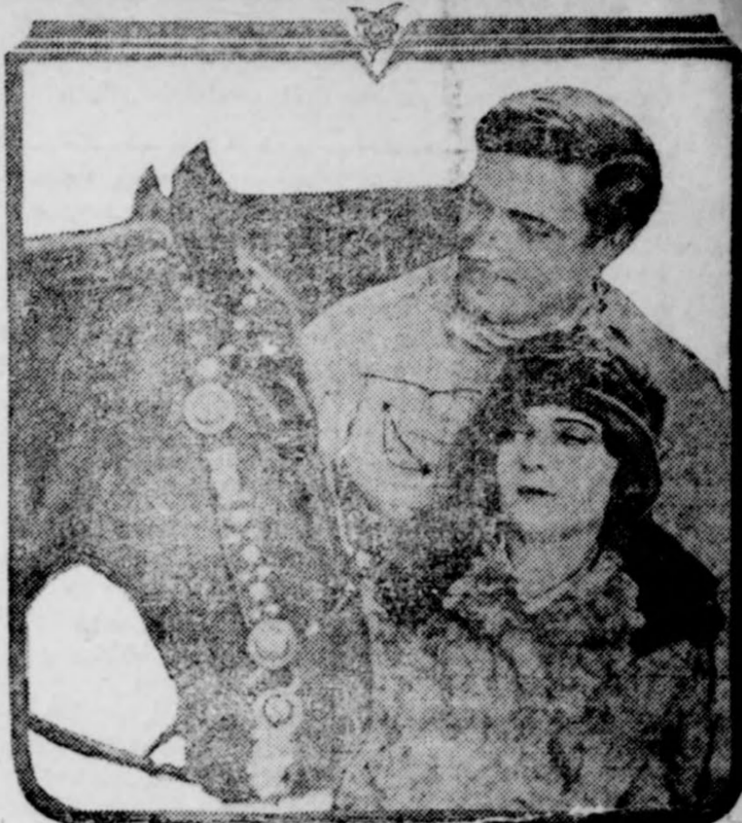
At State Theatre, Friday, December 12