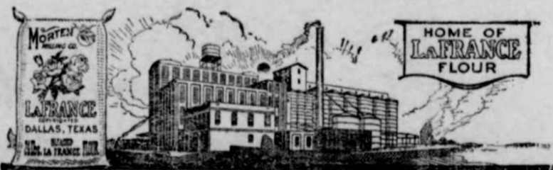
THE MORTEN MILLING COMPANY, DALLAS, TEX. U.S.A.

Fisk Tubes, Tires, Tools and Accessories.